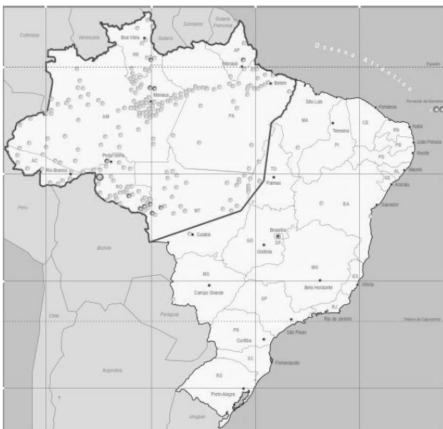
Figure 2 - Isolated systems in Brazil with predominance in the North Region

Isolated Systems (SI) are not connected to the SIN for technical or economic reasons and cover 235 locations, most of them in the Northern Region. Each system has a minimum structure to meet the electricity generation destined for an isolated location, its location mainly covering the Northern Region of Brazil, as shown in figure 2.