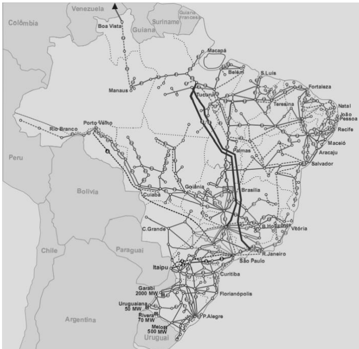
Figure 1. Map of the horizon transmission system